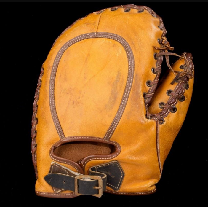
1940's Jimmy (sic) Foxx Globe 456.....$300