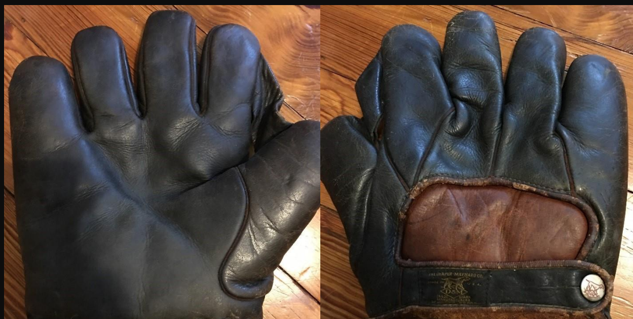
1920's D&M 1 Inch Web.....$450