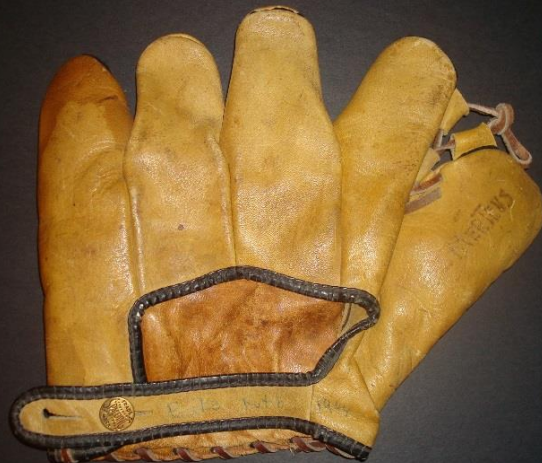
1930's Dizzy Dean Spalding DD21

This is a lower quality double tunnel loop model. It's in nice condition with a nice lining. It has never been cleaned. There is ink on the wrist strap and a name on the back of the thumb.....$175