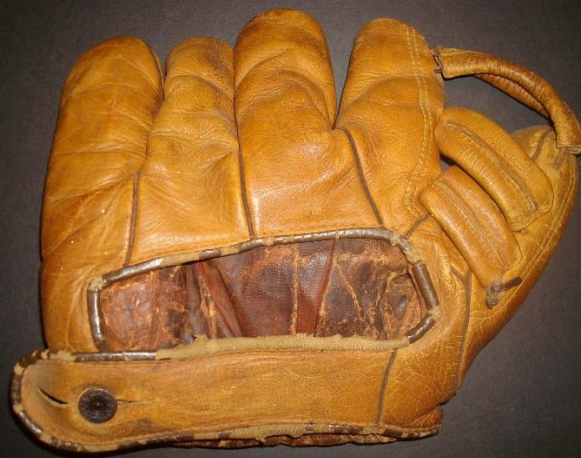
1940's Pee Wee Reese Noah's Ark V305

This is modeled off of the Denkert pattern it used for many private label companies and most closely resembles the Em-Jay Pee Wee Reese. Noah's Ark was an auto parts store and the stampings in the heel feature an ark logo, which is what originally drew me toward this extremely rare brand. The glove is very VGish with no major flaws. It has never been cleaned.....$75