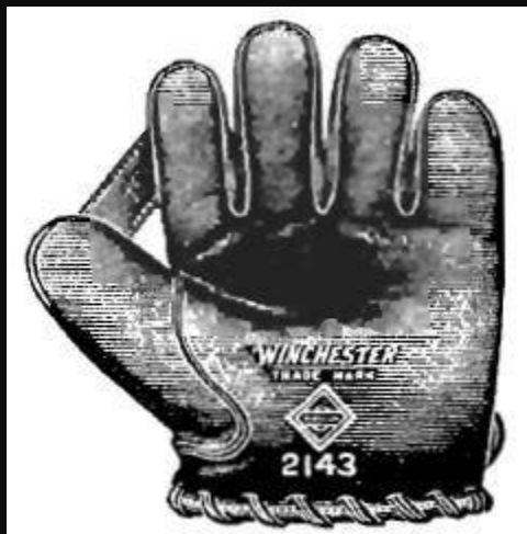
1920's Winchester 2143 1 Inch Web

This is a nice big Winchester 1 inch web. The lining has no holes and feels great on the hand despite the surface scuffs. The exterior leather is very supple and has not been cleaned so it would shine up nicely. It features a nice black & red Winchester tag. Nice feeling glove.....$300