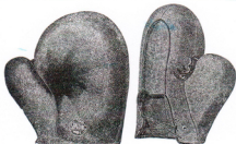
No. 6 O.

No. 7 O. SPALDING'S SPECIAL LEAGUE MITT, front, sides and hand of extra fine and specially tanned drab buckskin; the back of best quality dogskin. Padded with extra thick felt, and laced all around so that padding may be adjusted to suit the wearer. This Mitt is absolutely the finest protection for the hand ever made. Our Patent Short-fingered Throwing Glove with each Mitt. Price, $7.50