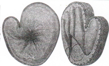
No. 7 O.

No. 8 O. SPALDING'S KENNEDY PATENT MITT, made of finest drab buckskin, well padded and steel frame around fingers and thumb, affording absolute protection against broken fingers. Back and thumb laced, giving opportunity to change padding to suit. Price, $10.00