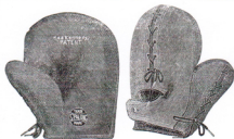
No. 8 O.

No. 8 O. SPALDING'S KENNEDY PATENT MITT, made of finest drab buckskin, well padded and steel frame around fingers and thumb, affording absolute protection against broken fingers. Back and thumb laced, giving opportunity to change padding to suit. Price, $10.00